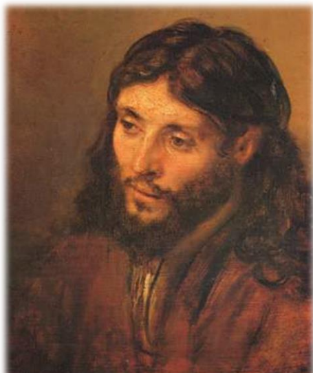
Head of Christ, Rembrandt von Rijn

'I have made your name known to those whom you gave me from the world. They were yours, and you gave them to me, and they have kept your word. Now they know that everything you have given me is from you; for the words that you gave to me I have given to them, and they have received them and know in truth that I came from you; and they have believed that you sent me. I am asking on their behalf; I am not asking on behalf of the world, but on behalf of those whom you gave me, because they are yours. All mine are yours and yours are mine; and I have been glorified in them. And now I am no longer in the world, but they are in the world, and I am coming to you. Holy Father, protect them in your name that you have given me, so that they may be one, as we are one. While I was with them, I protected them in your name that you have